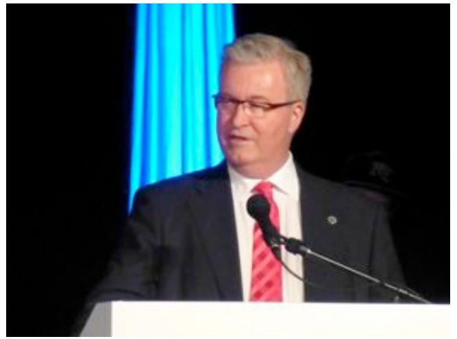
THREE PICTURES FROM THE 2014 WORLD FEDERATION OF Y's RETIRED