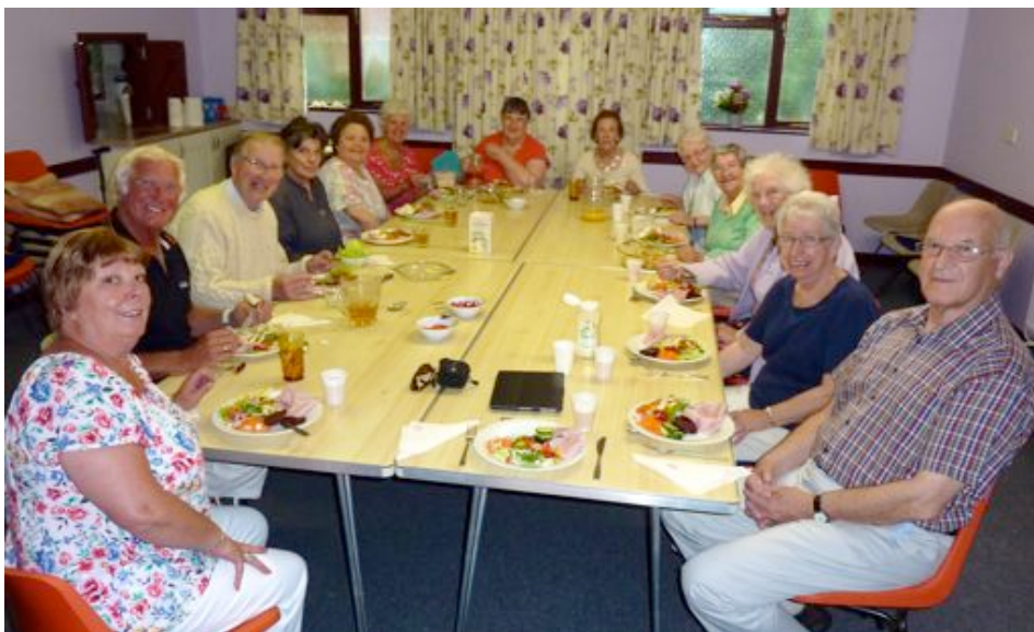
THE SOUTH WEST GROUP MET TOGETHER IN PASDTOW