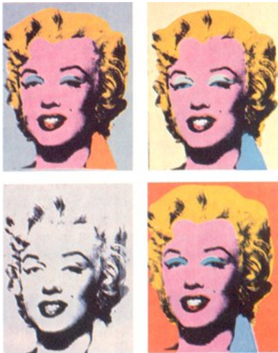
Andy Warhol – Greatest of the pop artists; used the mass production technique of silk-screening to produce and reproduce images; commented on fame, consumerism, identity, and conformity.