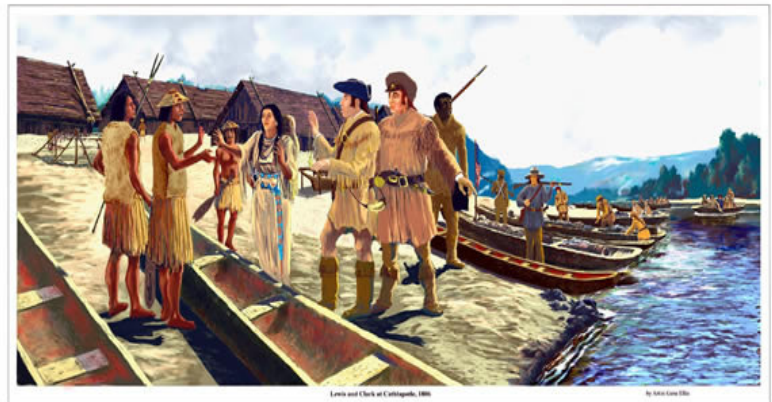
Lewis and Clark at Cahoga, 1805