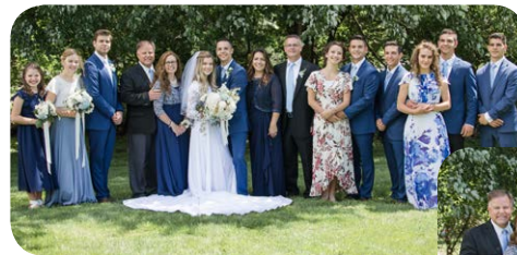
the newlyweds pictured with their parents and families