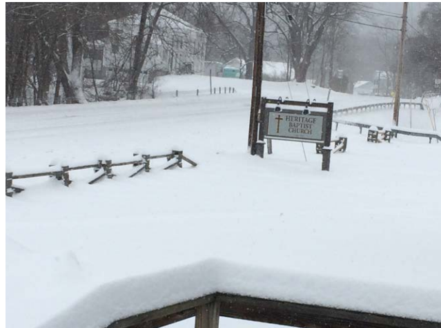
snow-covered road and church parking lot, Toepke Hall in the distance

Last Sunday we had to cancel the Sunday services because of snow and dangerous road conditions. We received about 12 to 14 inches of snow and then the weather turned very cold with temperatures dropping to a minus 8 degrees the first part of this week.