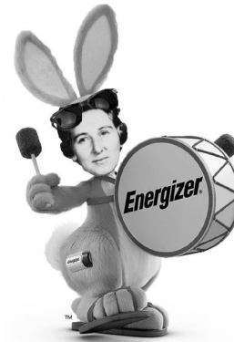
The "Notorious Energizer Thelma"