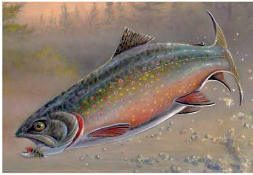
2002 Wisconsin Trout Stamp By Bill Millonig