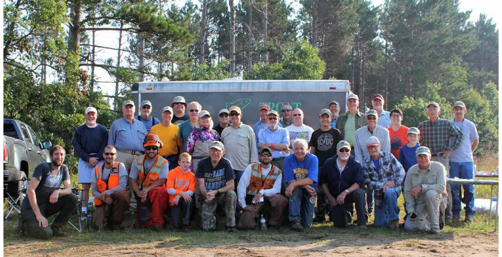
Aug. 19 stream habitat workday on the Pine River