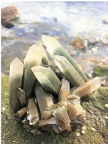
FOREST CRYSTAL CLUSTER