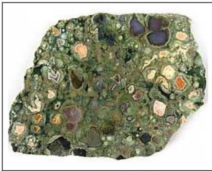
Green Rhyolite also known as Australian Rainforest Jasper - (in it's Rough State)