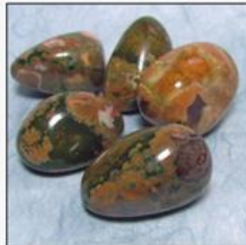
Rhyolite also known as Rainforest Jasper