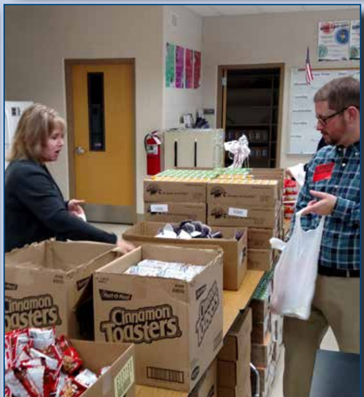
On Tuesday, January 31, 2017, we spent our lunch time packing backpacks at Branson High School to help them with their food backpack program.