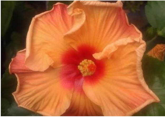
First Bloom of Lata's First Seedling