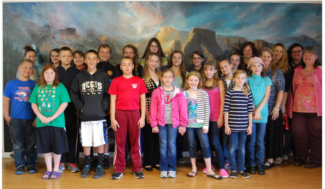
Our Fall Term Students and Staff!