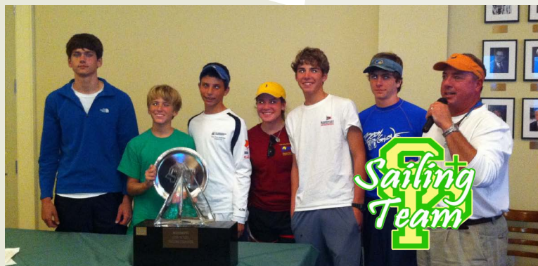
St. Patrick Catholic High School wins the Rock for the second year in a row!