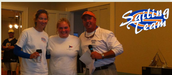
Gulfport High School 420A team finished 3rd in class!