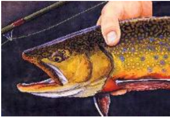
<<< Illustration “One Last Look - Brook Trout” courtesy of Bob White of Whitefish Studio