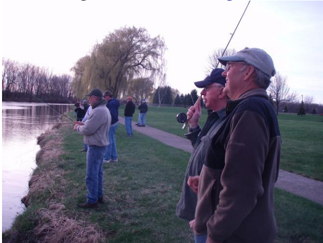
Casting Practice in Marble Park Lagoon

Postponement news will be posted on the www.cwtu.org homepage by 12:00 noon. No posting means no postponement. For more information on this event and other CWTU activities, go to www.cwtu.org .